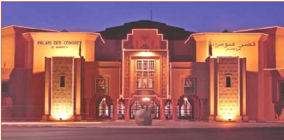
« Palais des Congrès » of Marrakesh

The Congress is held under the High Patronage of His Majesty the King Mohamed VI. It will take place at the “Palais des Congrès”, located on a large avenue in the heart of Marrakesh. It is an international center for exhibition, which provides all necessary technical background for organizing a successful meeting, and has already hosted several large medical conferences. Marrakesh is the first tourist city in Morocco and has more than 150 hotels. Many hotels are located close to the “Palais des Congrès” and are sufficient to accommodate all participants at less than 15 minutes walk. Marrakesh is also well known by his Ryads which are traditional houses and palaces with luxury and modern comfort.